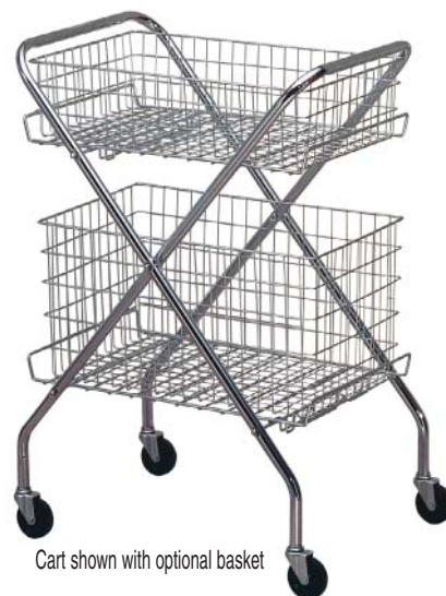
Cart shown with optional basket

272003 California Style Base Instrument Stand, 2 Pole Support